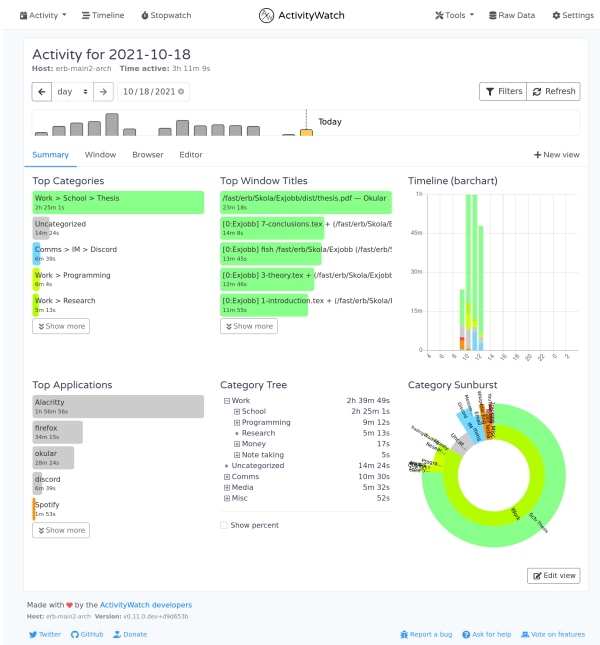
Figure 1: ActivityWatch activity dashboard. Showing top applications, window titles, browser domains, and categories.

But they are not without their limitations — among them a notably low signal-to-noise ratio [15] — yet visual evoked